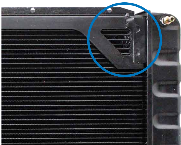
Radiator Image with reinforcement gussets